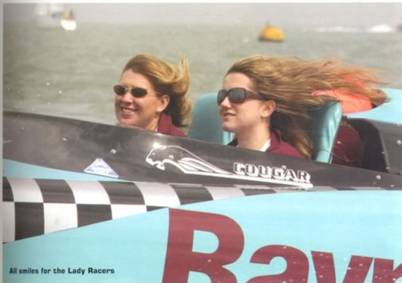
All smiles for the Lady Racers

Not content to make up the numbers these girls want to kick some ass on this testosterone-fuelled stage